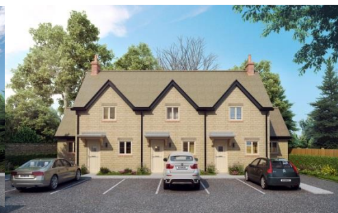
Plots 5,6 and 7