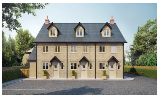
Plots 1,2 and 3

88 HAILEY ROAD, WITNEY, OXFORDSHIRE OX28 1HG